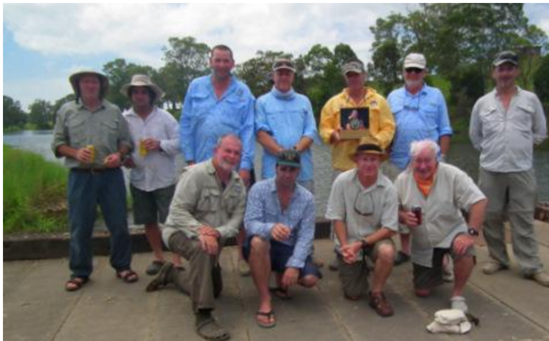
The crew at Byangum, minus Kate who is taking the picture