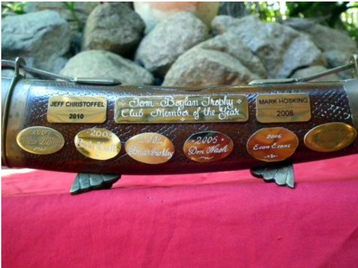
Past recipients of this award

The Club Member of the Year Award is set around club members who contribute substantially to the on goings of our club. In being awarded this honour, I was surprised and humbled when you look at the day to day contributions of so many in our club.