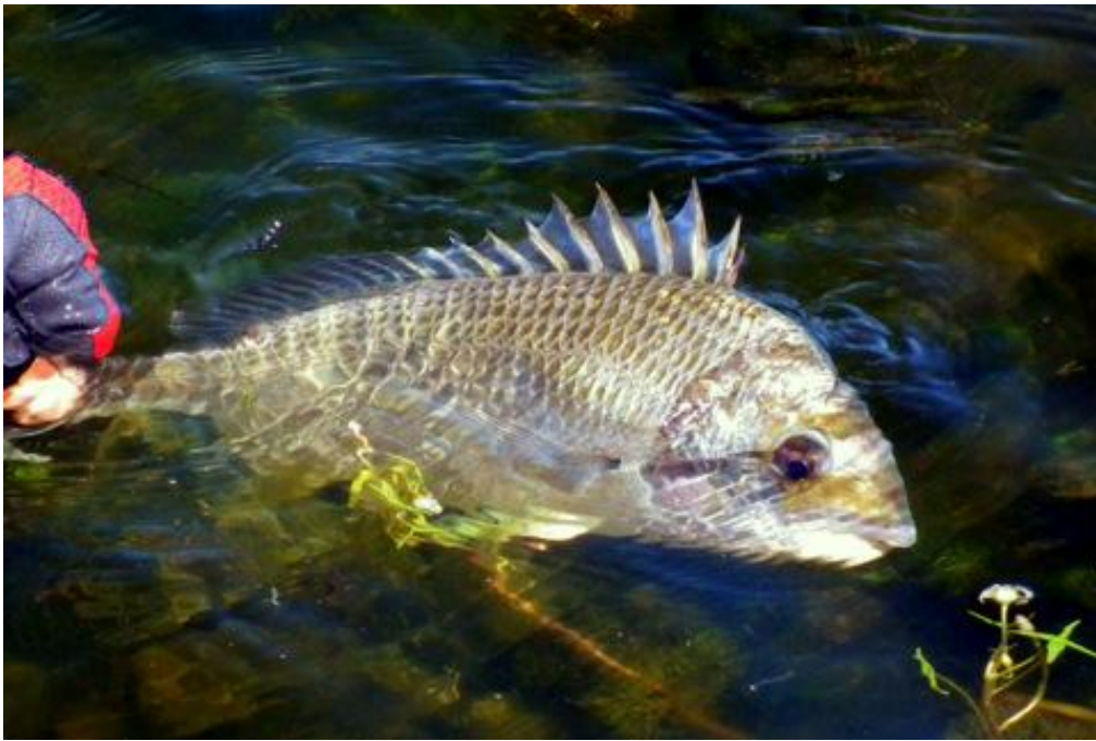
Home to mum

We made our way back to the launch area after checking out Mudgeeraba Creek and having a few casts under the bridge at the entrance to the creek. The amount of bait fish that was visible all the way through the system was amazing. Mullet, gar, herring and jelly prawn were across most locations. There seemed to be some surface action in close in the weed cover even as the sun sat higher in the sky.