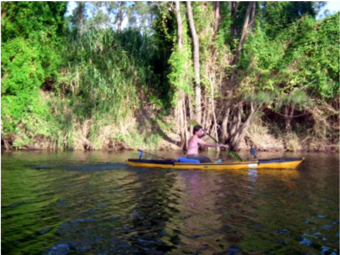
Denis showing good form

The early section of Oxley Creek looks like bass heaven, but the sun was much higher now and working deep was the only option to come up tight. After working some great looking snags we headed out into the main stream to see how the conditions were suiting the others.