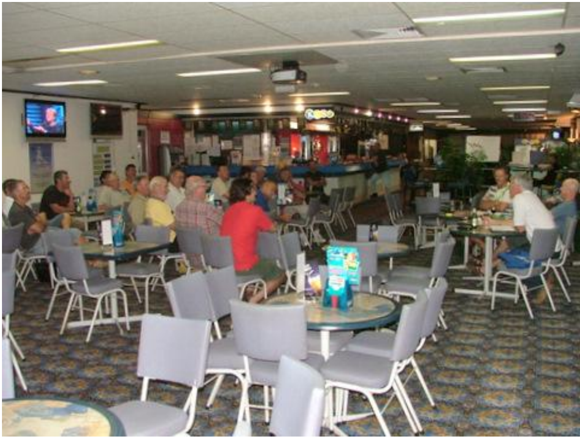
February Club Meeting