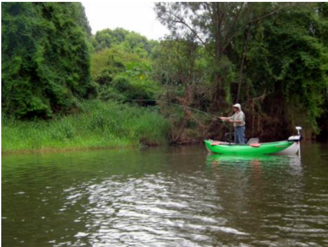
Brian prospecting the edge of the weeds in his "Caningi"

The early section of Oxley Creek looks like bass heaven, but the sun was much higher now and working deep was the only option to come up tight. After working some great looking snags we headed out into the main stream to see how the conditions were suiting the others.