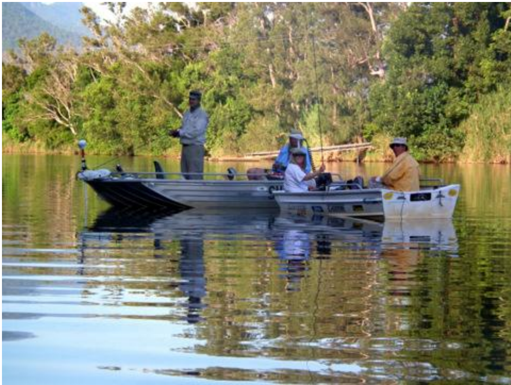
Comparing Notes in the shade of the overhanging trees

After putting in a cast with a suspending fly I was rewarded with a well hooked bass that played up like a second had lawn mower on the 5#.