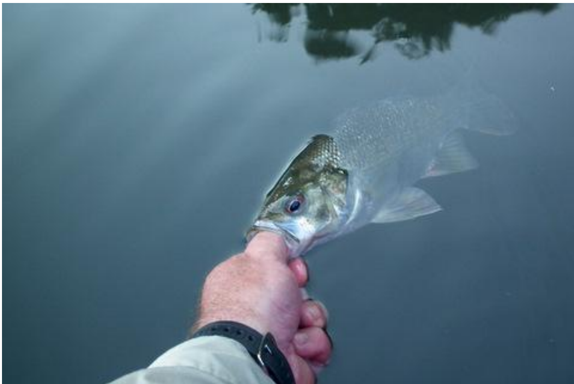
On his way home to the timber

After putting in a cast with a suspending fly I was rewarded with a well hooked bass that played up like a second had lawn mower on the 5#.