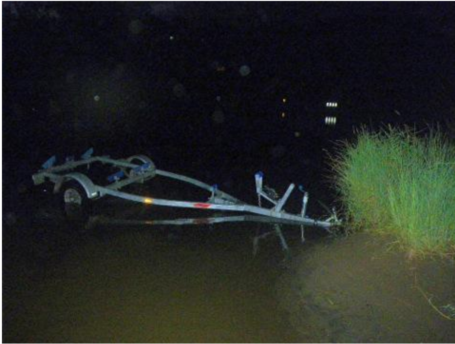
Ricks abandoned trailer. Pre-daybreak, Byangum